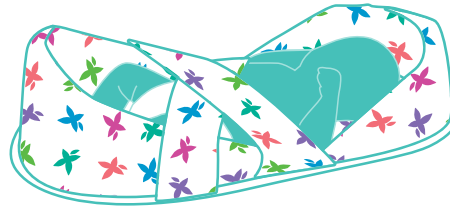
Baby in Nest