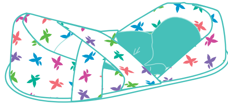
Baby in Nest