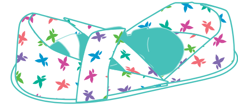
Baby in Nest